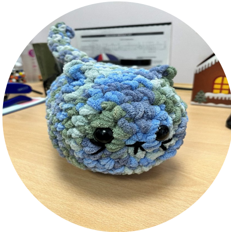
A wonderful crochet cat, thanks to JLS

Some of the craft skills they have developed are shown as below: